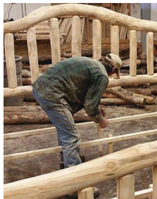
The team at Mountain Woods Furniture consists of 15 individuals.

More information about Mountain Woods Furniture can be found at www.mountainwoods furniture.com or contact info@mountainwoods furniture.com .