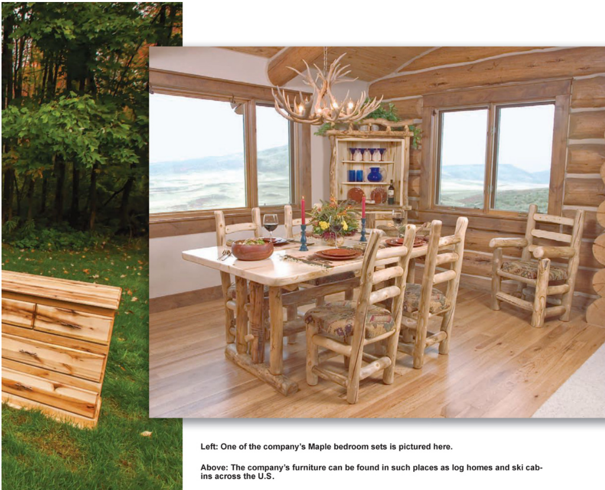
Left: One of the company's Maple bedroom sets is pictured here.