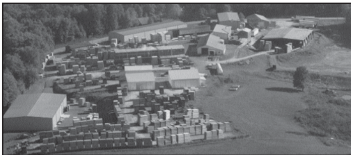
This is an aerial view of our modern Hardwood concentration yard where we process quality Appalachian Hardwood and Eastern White Pine lumber.

We at Bryant Church Hardwoods, Inc., located in Wilkesboro, NC, are proud of our modern Hardwood concentration yard facility that we constantly update to better serve our customers with the finest Appalachian Hardwood and Eastern White Pine lumber available. Call us at (336) 973-3691 when we can be of service.