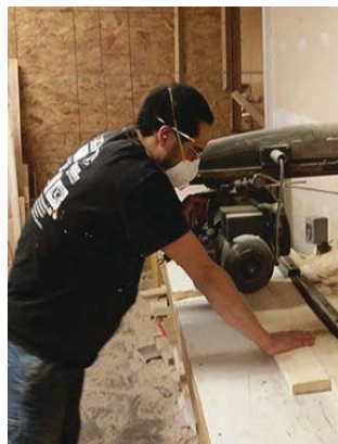
All of Mountain Woods Furniture’s products are hand-crafted.